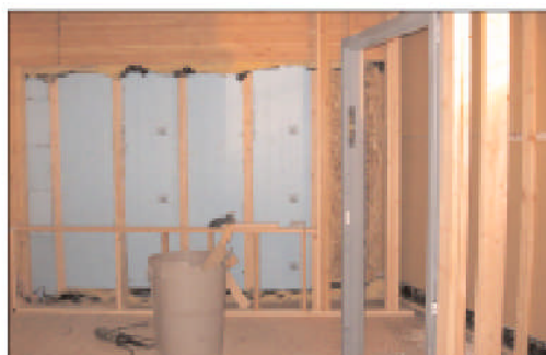
The library area is being framed.