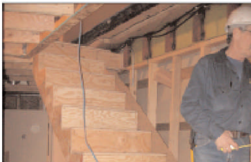
The stairs to the music library have been framed.