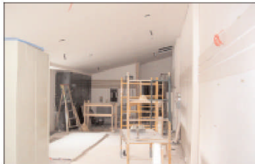
Sheetrock installation is almost complete in back stage area.