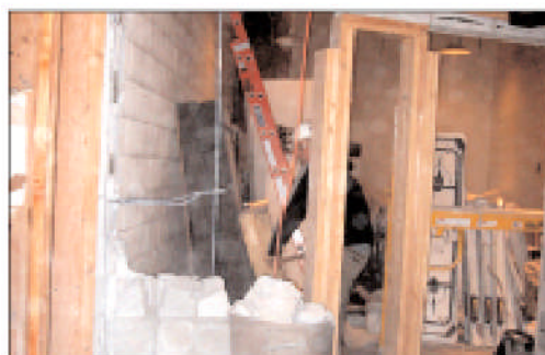
Workers are removing a CMU Wall to allow for addition of spiral staircase to Stage Hands area.