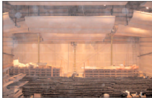
Drywall and taping are taking place in Main Hall.