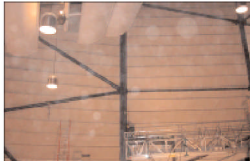
Painting continues in Main Hall.