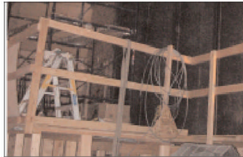
"Scallops" in the performance hall are currently being painted.