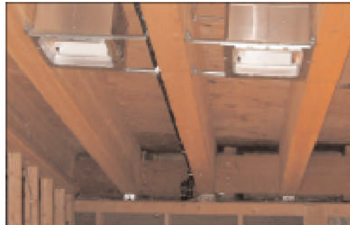
Lighting is being installed in the music library.