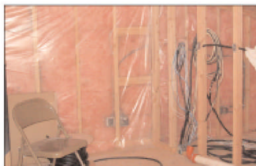
The Stage Hands area is being wired and insulated.